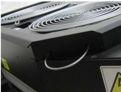
Alternative Corner Lock Hangers