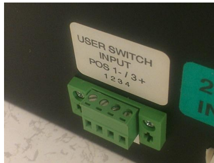
Phoenix type screw terminal connector