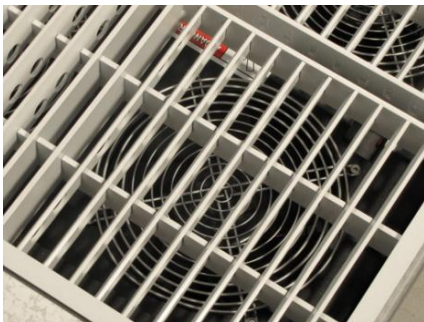
4 x Redundant Energy Efficient EC Fans with 0-100%